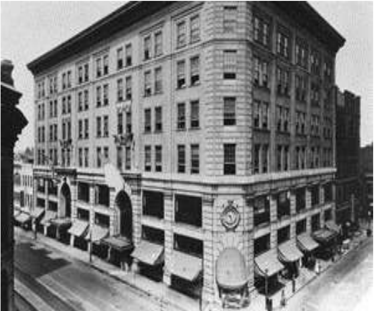
Rich's Department Store, Atlanta, 1925