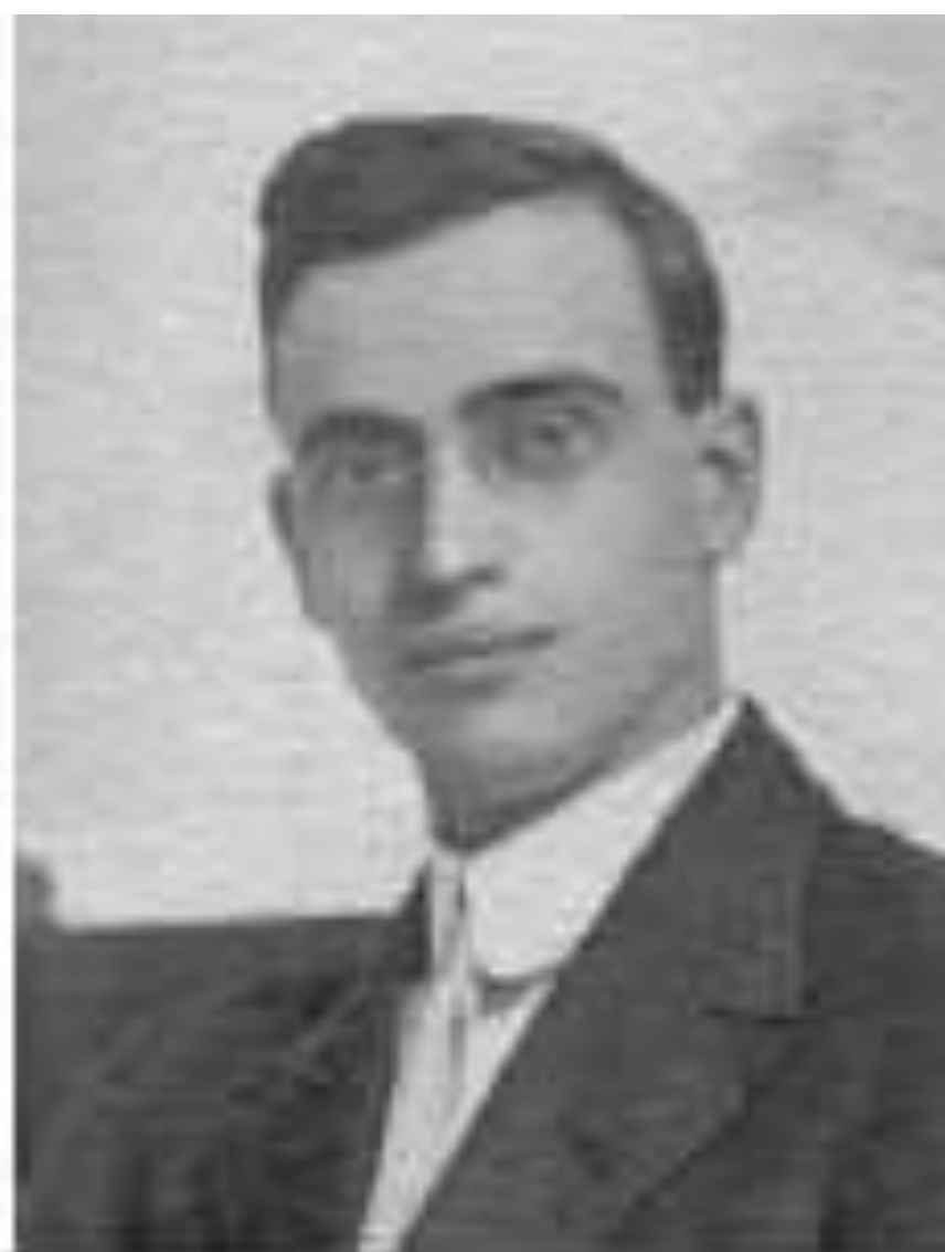
Leo Frank, 1914.