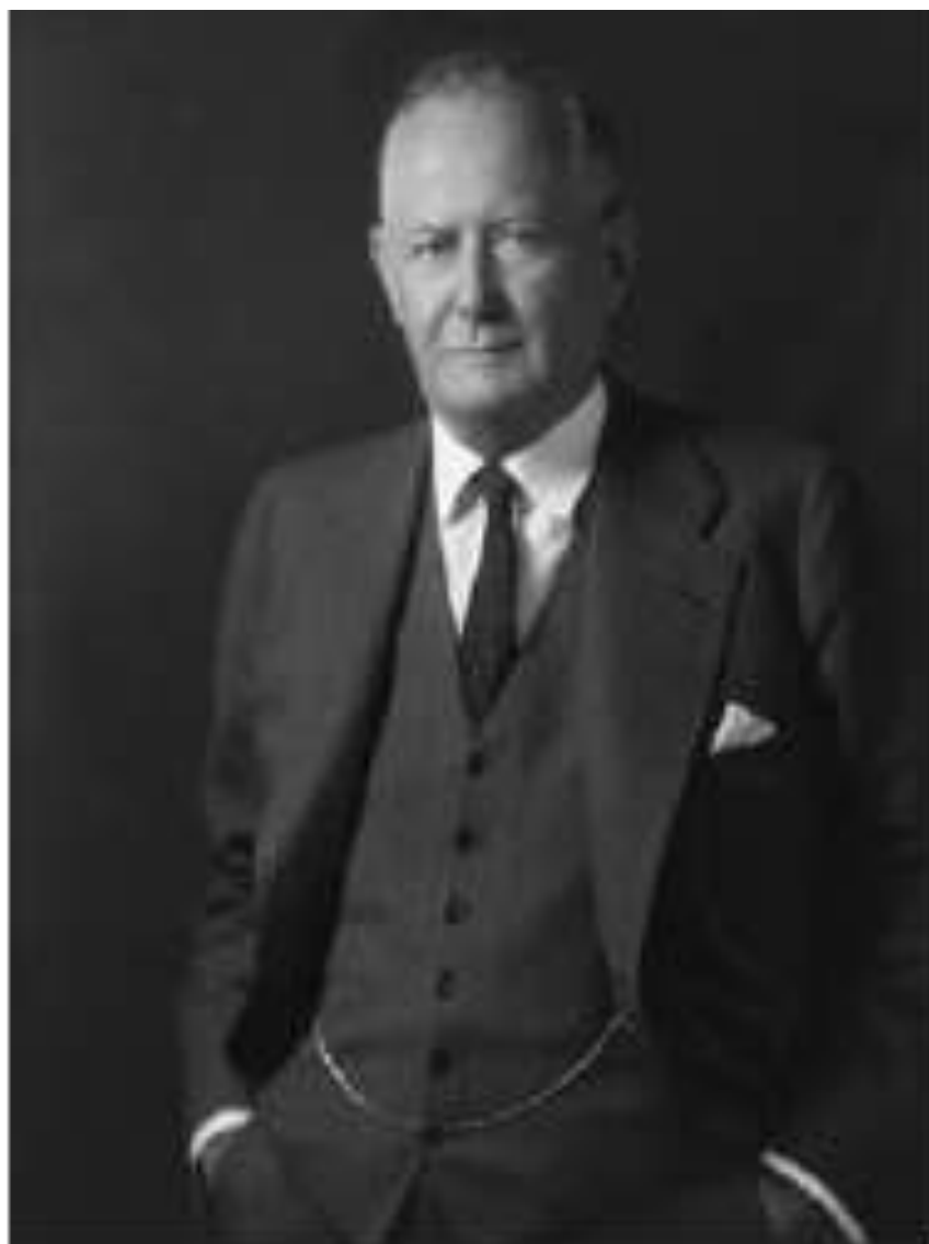
Governor John M. Slaton, c.1935.